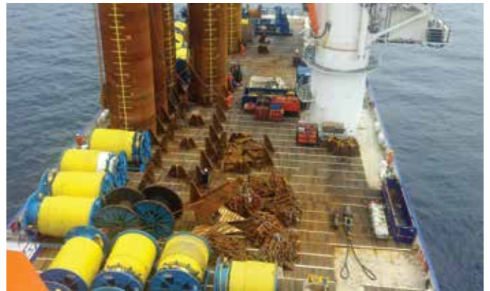
West Seno Mooring Installation