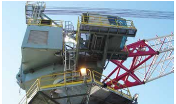
Supply & Installation of Crane Ropes