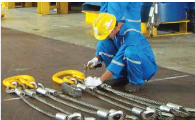
Sling Production to client's requirements