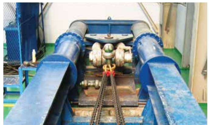
Inspection and Load Testing equipment