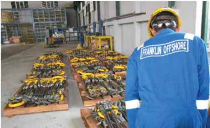
Rigging & Lifting Equipment Supply