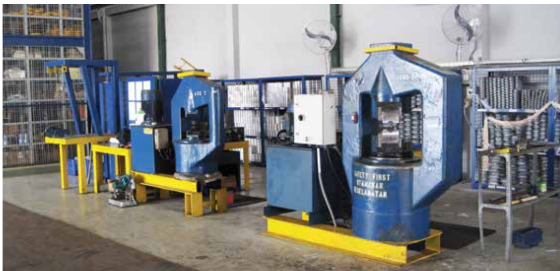
Wire Rope Sling Production

Untuk pekerjaan darat (Onshore), kami menyediakan layanan produk dan jasa untuk Perusahaan jasa baik di lepas pantai dan darat dalam industri pertambangan.