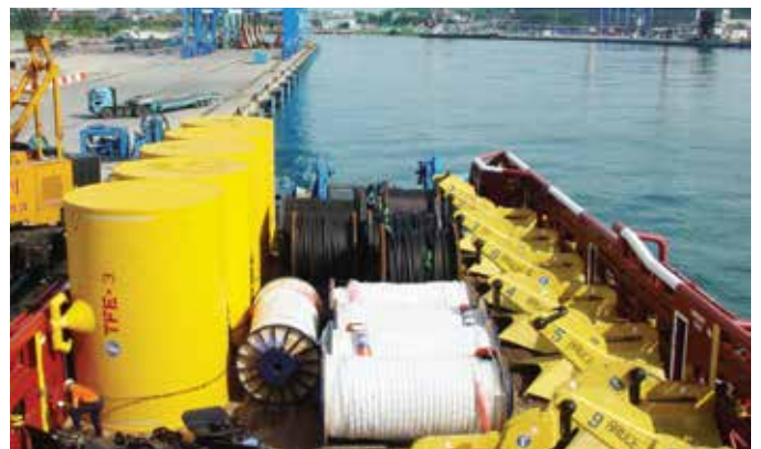
Provision of Pre-Laid Mooring Services